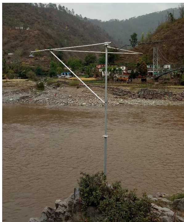
Typical Drawing & Photo of Mast for fixing Sensors