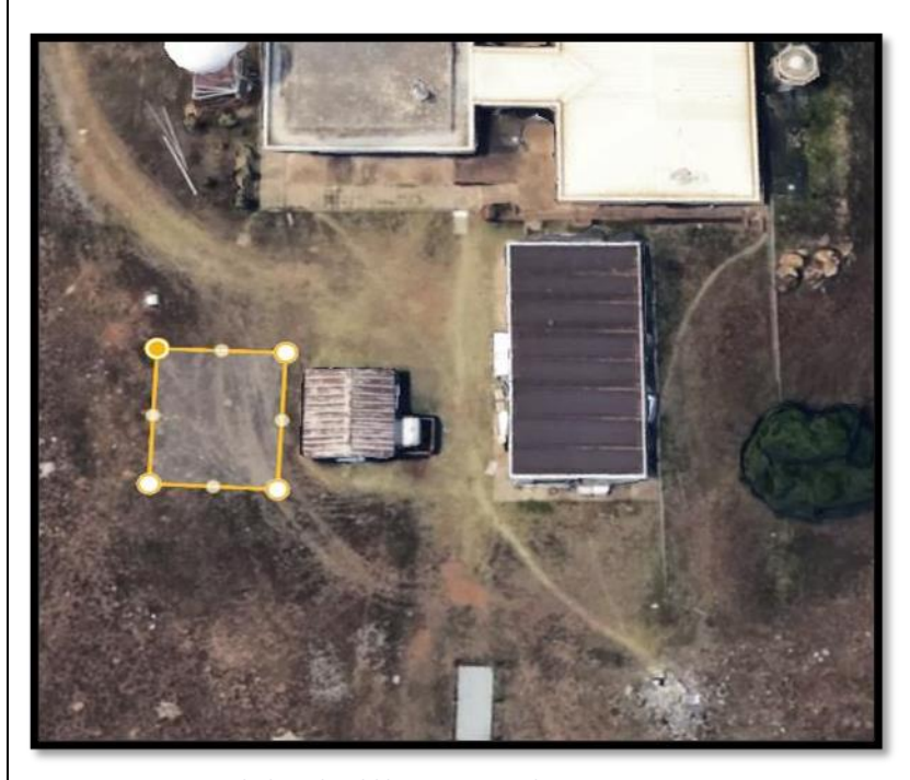
Figure 3 Area were shelter should be constructed.