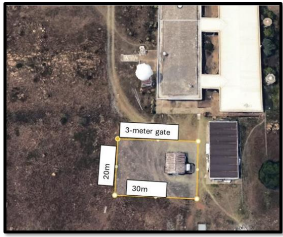
Figure 2: Aerial view of the area to be fenced.